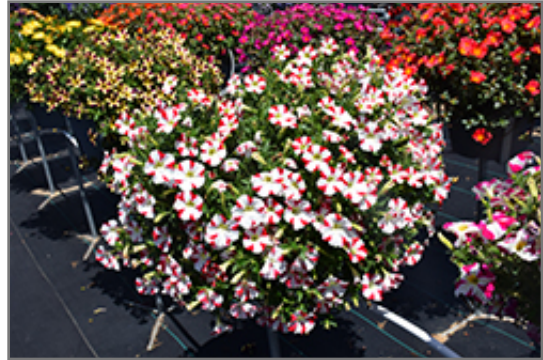
Amore King of Hearts Petunia in bloom

Amore King of Hearts Petunia will grow to be about 12 inches tall at maturity, with a spread of 14 inches. When grown in masses or used as a bedding plant, individual plants should be spaced approximately 10 inches apart. Its foliage tends to remain dense right to the ground, not requiring facer plants in front. This fast-growing annual will normally live for one full growing season, needing replacement the following year.