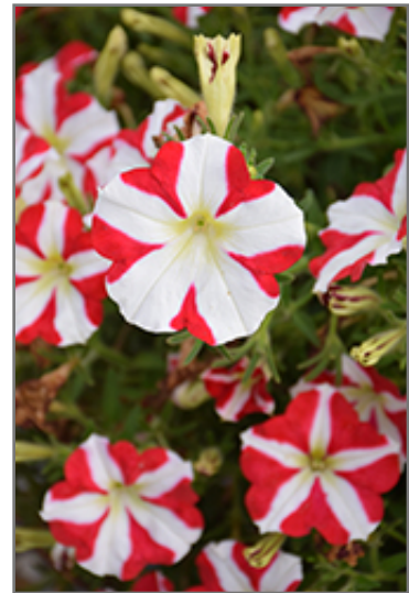
Amore King of Hearts Petunia flowers

Amore King of Hearts Petunia is recommended for the following landscape applications;