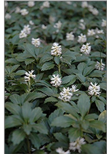
Japanese Spurge flowers