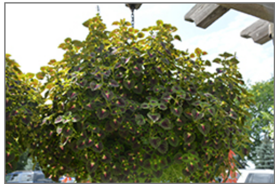
ColorBlaze Strawberry Drop Coleus