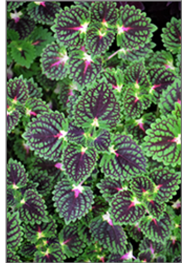
ColorBlaze Strawberry Drop Coleus foliage

ColorBlaze Strawberry Drop Coleus is recommended for the following landscape applications;