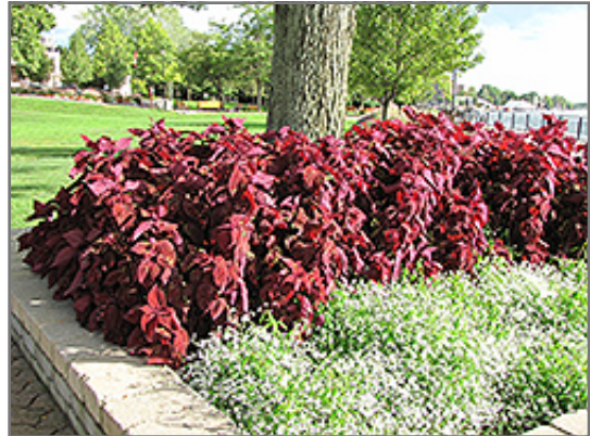
ColorBlaze Rediculous Coleus