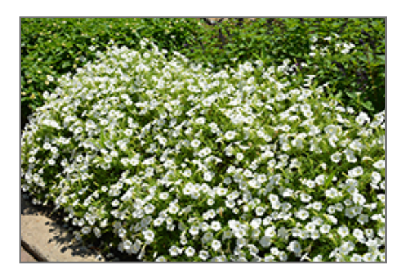
Supertunia Vista Snowdrift Petunia in bloom

This plant will require occasional maintenance and upkeep. Trim off the flower heads after they fade and die to encourage more blooms late into the season. It is a good choice for attracting butterflies and hummingbirds to your yard, but is not particularly attractive to deer who tend to leave it alone in favor of tastier treats. It has no significant negative characteristics.