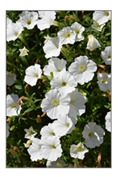
Supertunia Vista Snowdrift Petunia flowers