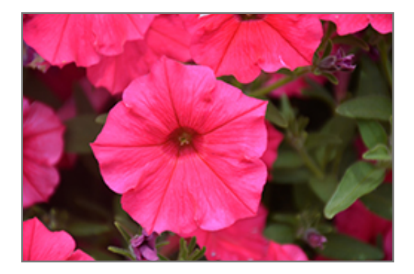
Supertunia Vista Paradise Petunia flowers

Supertunia Vista Paradise Petunia is recommended for the following landscape applications;