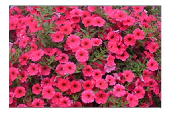
Supertunia Vista Paradise Petunia flowers