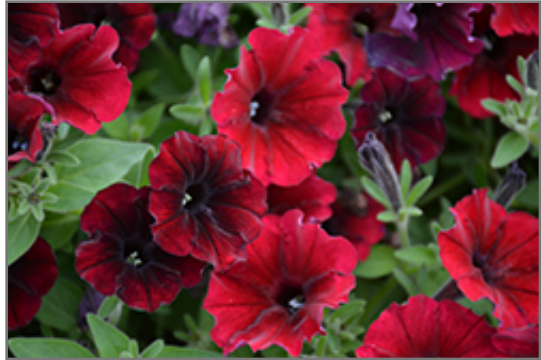
Supertunia Black Cherry Petunia flowers

Supertunia Black Cherry Petunia will grow to be about 10 inches tall at maturity, with a spread of 24 inches. When grown in masses or used as a bedding plant, individual plants should be spaced approximately 16 inches apart. Its foliage tends to remain low and dense right to the ground. This fast-growing annual will normally live for one full growing season, needing replacement the following year.