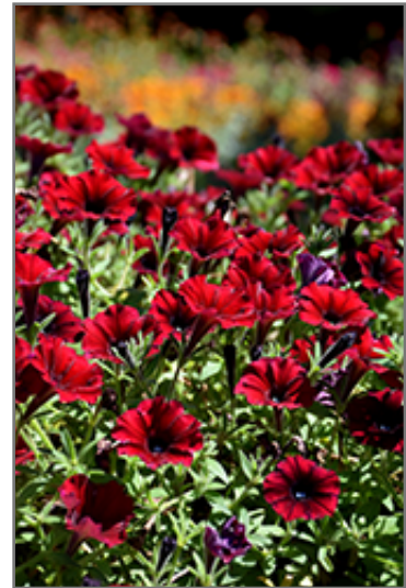
Supertunia Black Cherry Petunia flowers