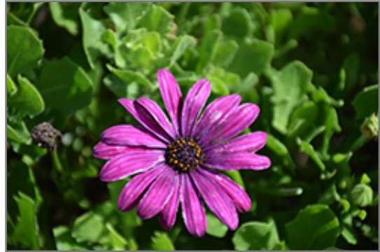
Bright Lights Purple African Daisy flowers