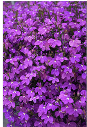
Laguna Ultraviolet Lobelia flowers

Laguna Ultraviolet Lobelia is recommended for the following landscape applications;