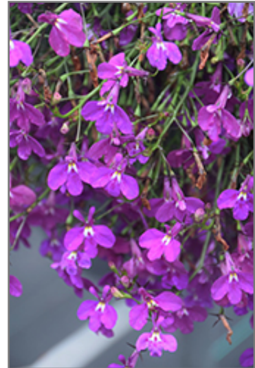
Laguna Ultraviolet Lobelia flowers