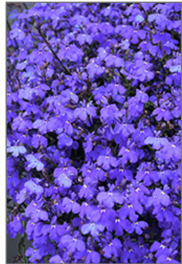
Laguna Dark Blue Lobelia flowers

Laguna Dark Blue Lobelia is recommended for the following landscape applications;