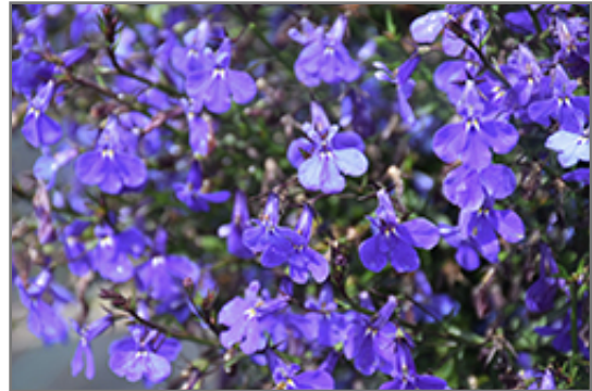
Laguna Dark Blue Lobelia flowers