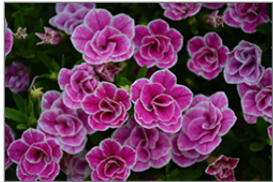
Superbells Doublette Love Swept Calibrachoa flowers

Superbells Doublette Love Swept Calibrachoa is a dense herbaceous annual with a trailing habit of growth, eventually spilling over the edges of hanging baskets and containers. Its medium texture blends into the garden, but can always be balanced by a couple of finer or coarser plants for an effective composition.