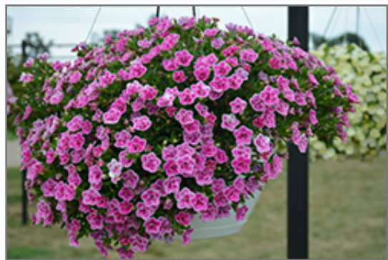
Superbells Doublette Love Swept Calibrachoa in bloom