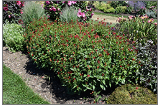
Little Redhead Indian Pink in bloom

Little Redhead Indian Pink will grow to be about 20 inches tall at maturity, with a spread of 24 inches. When grown in masses or used as a bedding plant, individual plants should be spaced approximately 20 inches apart. Its foliage tends to remain dense right to the ground, not requiring facer plants in front. It grows at a fast rate, and under ideal conditions can be expected to live for approximately 5 years. As an herbaceous perennial, this plant will usually die back to the crown each winter, and will regrow from the base each spring. Be careful not to disturb the crown in late winter when it may not be readily seen!