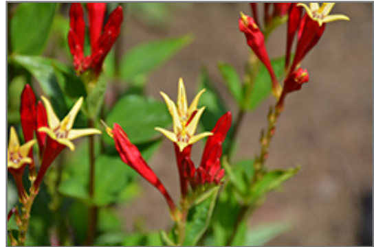
Little Redhead Indian Pink flowers