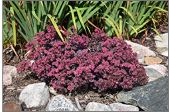
Dream Dazzler Stonecrop in bloom