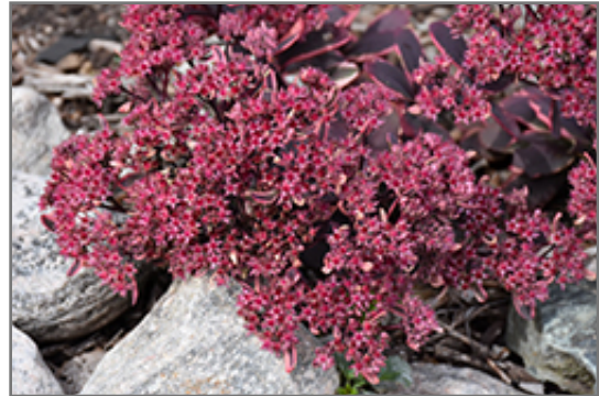
Dream Dazzler Stonecrop flowers