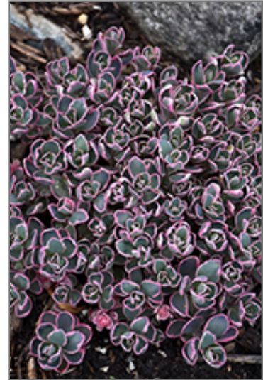
Dream Dazzler Stonecrop foliage

Dream Dazzler Stonecrop is a dense herbaceous perennial with an upright spreading habit of growth. Its medium texture blends into the garden, but can always be balanced by a couple of finer or coarser plants for an effective composition.