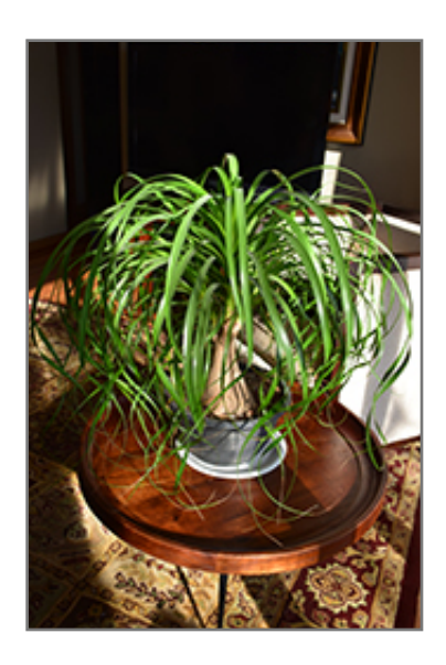
Pony Tail Palm in full

There are many factors that will affect the ultimate height, spread and overall performance of a plant when grown indoors; among them, the size of the pot it's growing in, the amount of light it receives, watering frequency, the pruning regimen and repotting schedule. Use the information described here as a guideline only; individual performance can and will vary. Please contact the store to speak with one of our experts if you are interested in further details concerning recommendations on pot size, watering, pruning, repotting, etc.