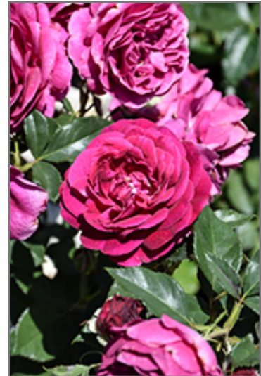
Celestial Night Rose flowers