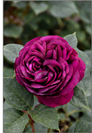
Celestial Night Rose flowers