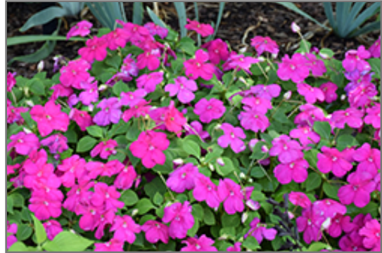
Beacon Violet Shades Impatiens flowers

Beacon Violet Shades Impatiens will grow to be about 15 inches tall at maturity, with a spread of 12 inches. When grown in masses or used as a bedding plant, individual plants should be spaced approximately 8 inches apart. Its foliage tends to remain dense right to the ground, not requiring facer plants in front. This fast-growing annual will normally live for one full growing season, needing replacement the following year.