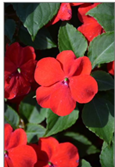
Beacon Bright Red Impatiens flowers