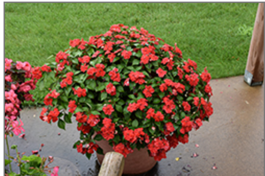
Beacon Bright Red Impatiens flowers

Beacon Bright Red Impatiens is recommended for the following landscape applications;