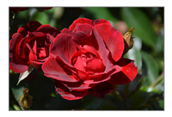
Brick House Rose flowers

Brick House Rose is recommended for the following landscape applications;