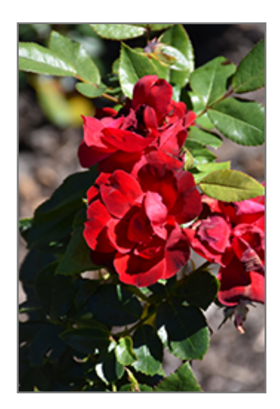
Brick House Rose flowers