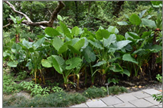
Calidora Elephant's Ear