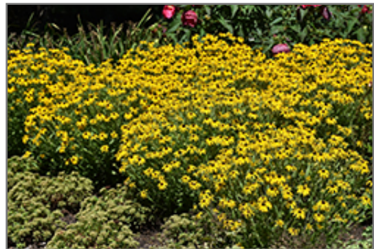
American Gold Rush Coneflower in bloom