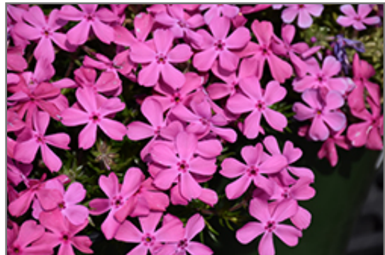
Moss Phlox flowers

Moss Phlox is recommended for the following landscape applications;