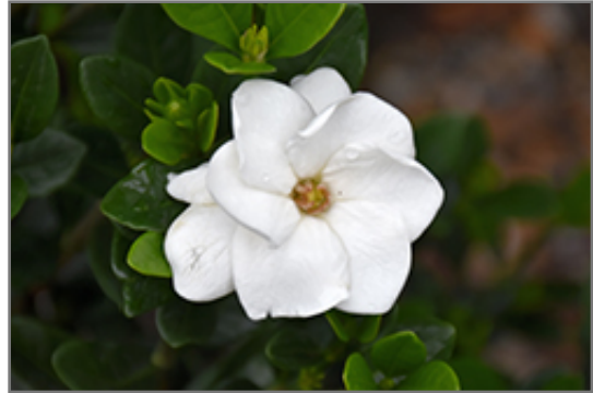
Gardenia flowers

When grown indoors, Gardenia can be expected to grow to be about 8 feet tall at maturity, with a spread of 6 feet. It grows at a slow rate, and under ideal conditions can be expected to live for approximately 30 years. This houseplant will do well in a location that gets either direct or indirect sunlight, although it will usually require a more brightly-lit environment than what artificial indoor lighting alone can provide. It does best in average to evenly moist soil, but will not tolerate standing water. The surface of the soil shouldn't be allowed to dry out completely, and so you should expect to water this plant once and possibly even twice each week. Be aware that your particular watering schedule may vary depending on its location in the room, the pot size, plant size and other conditions; if in doubt, ask one of our experts in the store for advice. It is very fussy about its soil conditions and must be grown in rich, acidic soil to ensure success. Contact the store for specific recommendations on pre-mixed potting soil for this plant.