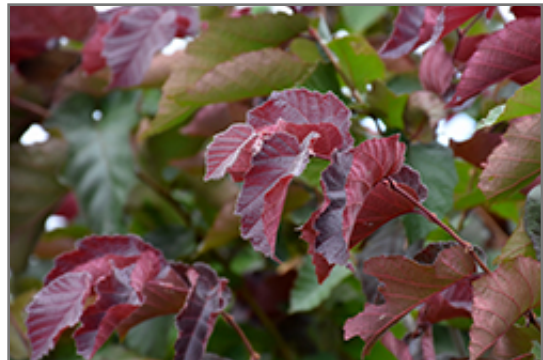
Purpleleaf Bailey Select American Hazelnut foliage