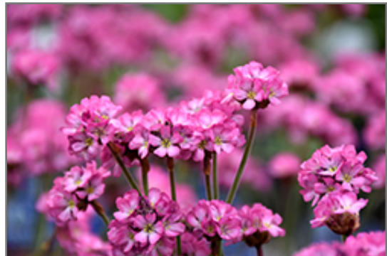
Vesuvius Black-leaved Sea Thrift flowers

Vesuvius Black-leaved Sea Thrift is recommended for the following landscape applications;