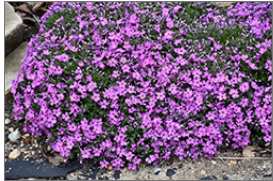
Rocky Road Pink Phlox in bloom