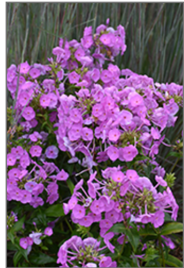
Fashionably Early Flamingo Garden Phlox flowers