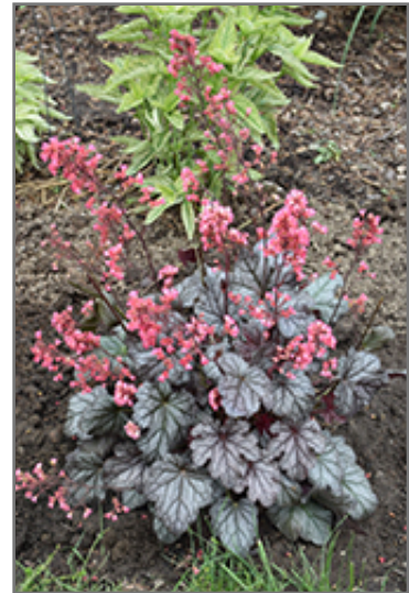
Timeless Treasure Coral Bells in bloom