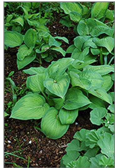
Paul's Glory Hosta