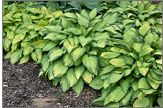
Paul's Glory Hosta

Paul's Glory Hosta is recommended for the following landscape applications;