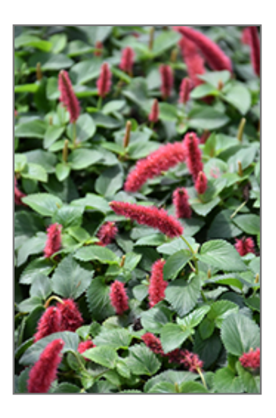
Dwarf Chenille Plant flowers

When grown indoors, Dwarf Chenille Plant can be expected to grow to be only 6 inches tall at maturity, with a spread of 15 inches. It grows at a medium rate, and under ideal conditions can be expected to live for approximately 3 years. This houseplant will do well in a location that gets either direct or indirect sunlight, although it will usually require a more brightly-lit environment than what artificial indoor lighting alone can provide. It prefers to grow in average to moist soil. The surface of the soil shouldn't be allowed to dry out completely, and so you should expect to water this plant once and possibly even twice each week. Be aware that your particular watering schedule may vary depending on its location in the room, the pot size, plant size and other conditions; if in doubt, ask one of our experts in the store for advice. It is not particular as to soil type or pH; an average potting soil should work just fine. Be warned that parts of this plant are known to be toxic to humans and animals, so special care should be exercised if growing it around children and pets.