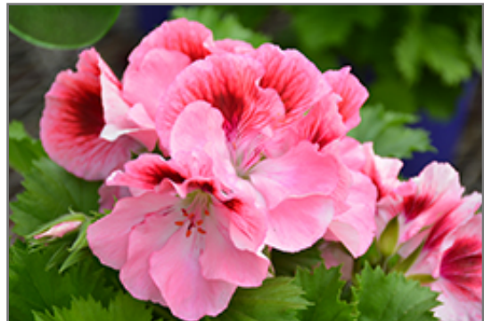
Elegance Ballet Geranium flowers

Elegance Ballet Geranium is recommended for the following landscape applications;