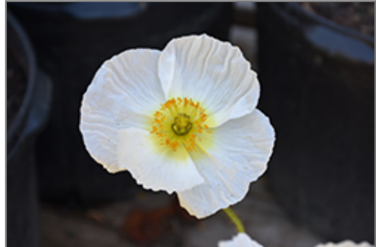
Champagne Bubbles White Poppy flowers