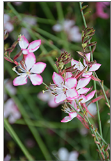
Rosy Jane Gaura flowers

Rosy Jane Gaura is recommended for the following landscape applications;