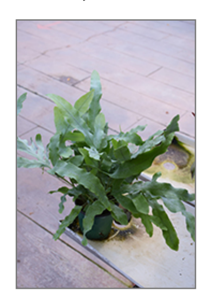
Blue Star Fern in full