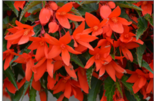
Waterfall Encanto Orange Begonia flowers

This is a high maintenance plant that will require regular care and upkeep, and usually looks its best without pruning, although it will tolerate pruning. Deer don't particularly care for this plant and will usually leave it alone in favor of tastier treats. Gardeners should be aware of the following characteristic(s) that may warrant special consideration;