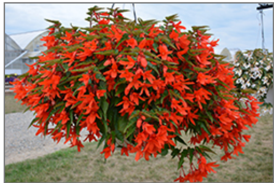
Waterfall Encanto Orange Begonia in bloom