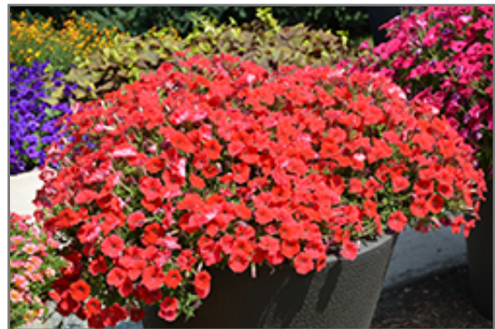
Supertunia Really Red Petunia in bloom