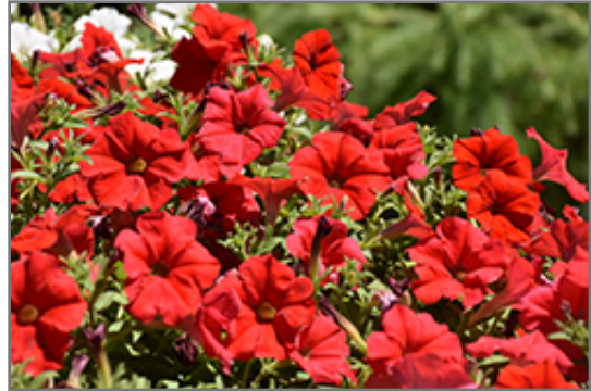
Supertunia Really Red Petunia flowers

Supertunia Really Red Petunia is a fine choice for the garden, but it is also a good selection for planting in outdoor containers and hanging baskets. Because of its trailing habit of growth, it is ideally suited for use as a 'spiller' in the 'spiller-thriller-filler' container combination; plant it near the edges where it can spill gracefully over the pot. Note that when growing plants in outdoor containers and baskets, they may require more frequent waterings than they would in the yard or garden.