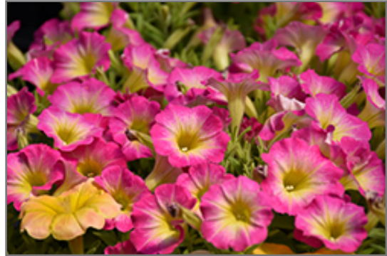
Supertunia Daybreak Charm Petunia flowers

Supertunia Daybreak Charm Petunia will grow to be about 10 inches tall at maturity, with a spread of 24 inches. When grown in masses or used as a bedding plant, individual plants should be spaced approximately 15 inches apart. Its foliage tends to remain low and dense right to the ground. This fast-growing annual will normally live for one full growing season, needing replacement the following year.