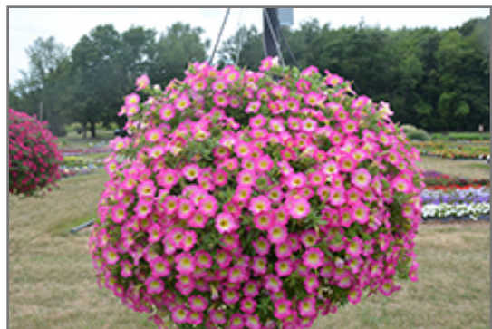
Supertunia Daybreak Charm Petunia in bloom