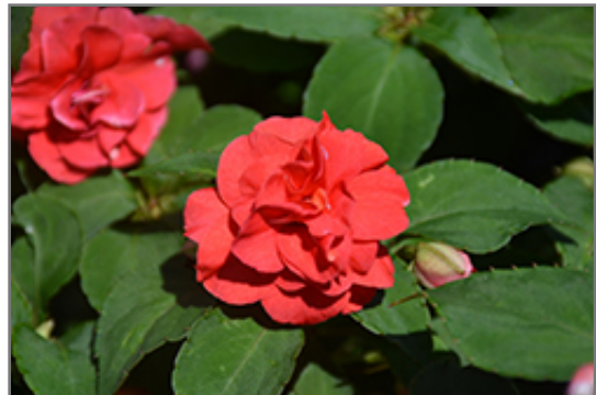
Rockapulco Red Impatiens flowers