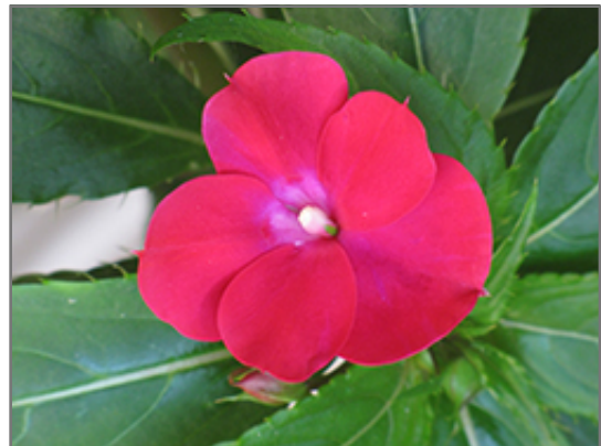
Infinity Cherry Red New Guinea Impatiens flowers