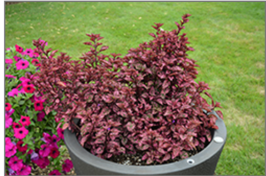
Hippo Rose Polka Dot Plant