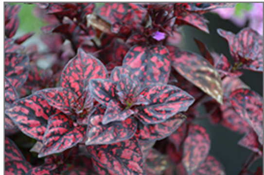
Hippo Red Polka Dot Plant foliage

Hippo Red Polka Dot Plant is recommended for the following landscape applications;