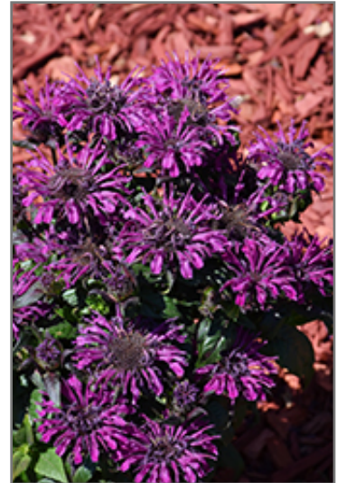
Rockin' Raspberry Beebalm flowers