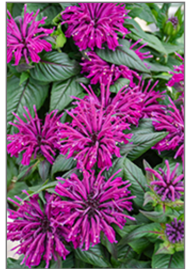
Rockin' Raspberry Beebalm flowers