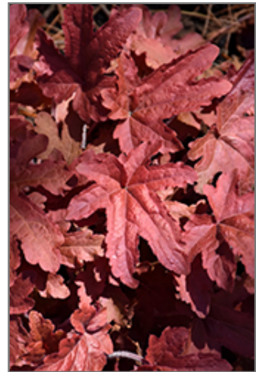
Fun and Games Red Rover Foamy Bells foliage

Fun and Games Red Rover Foamy Bells is recommended for the following landscape applications;