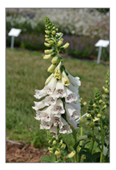
Dalmatian White Foxglove flowers

Dalmatian White Foxglove is recommended for the following landscape applications;