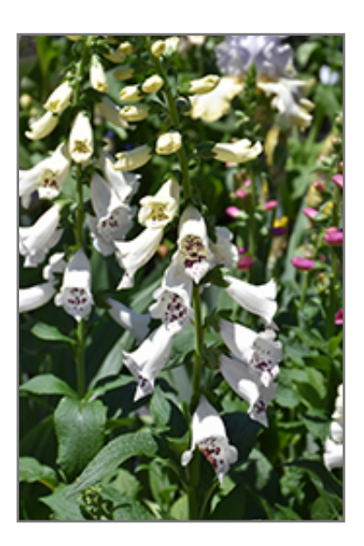
Dalmatian White Foxglove flowers