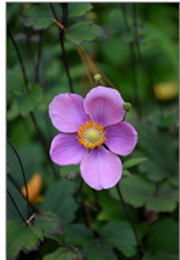
Lucky Charm Anemone flowers