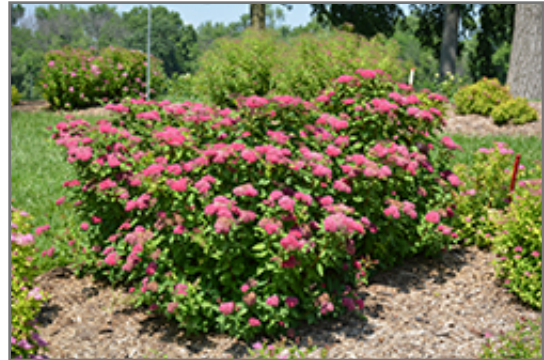
Double Play Red Spirea in bloom