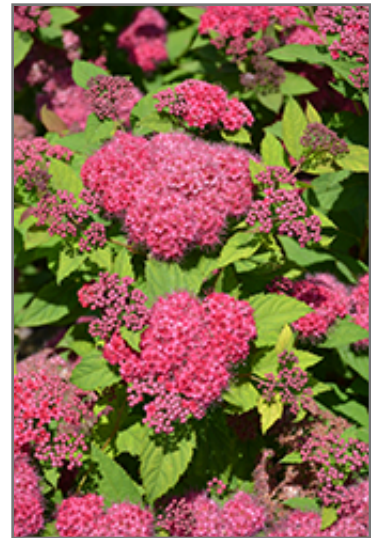
Double Play Red Spirea flowers

Double Play Red Spirea is recommended for the following landscape applications;