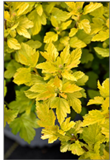
Tiny Wine Gold Ninebark foliage

Tiny Wine Gold Ninebark is recommended for the following landscape applications;