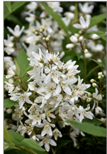
Yuki Snowflake Deutzia flowers