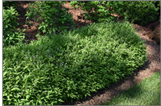
Yuki Snowflake Deutzia

This shrub should only be grown in full sunlight. It is very adaptable to both dry and moist locations, and should do just fine under typical garden conditions. It is not particular as to soil type or pH. It is highly tolerant of urban pollution and will even thrive in inner city environments. This particular variety is an interspecific hybrid.