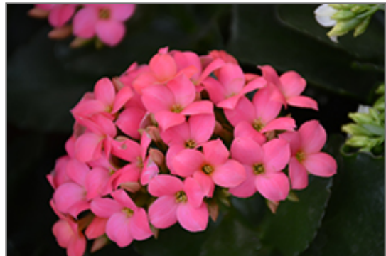
Coral Kalanchoe flowers