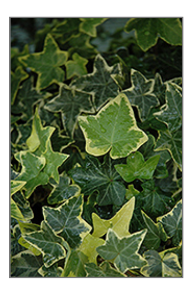
Gold Child Ivy foliage

When grown indoors, Gold Child Ivy can be expected to grow to be about 10 feet tall at maturity, with a spread of 3 feet. It grows at a medium rate, and under ideal conditions can be expected to live for approximately 30 years. This houseplant performs well in both bright or indirect sunlight and strong artificial light, and can therefore be situated in almost any well-lit room or location. It prefers to grow in average to moist soil. The surface of the soil shouldn't be allowed to dry out completely, and so you should expect to water this plant once and possibly even twice each week. Be aware that your particular watering schedule may vary depending on its location in the room, the pot size, plant size and other conditions; if in doubt, ask one of our experts in the store for advice. It is not particular as to soil pH, but grows best in rich soil. Contact the store for specific recommendations on pre-mixed potting soil for this plant. Be warned that parts of this plant are known to be toxic to humans and animals, so special care should be exercised if growing it around children and pets.