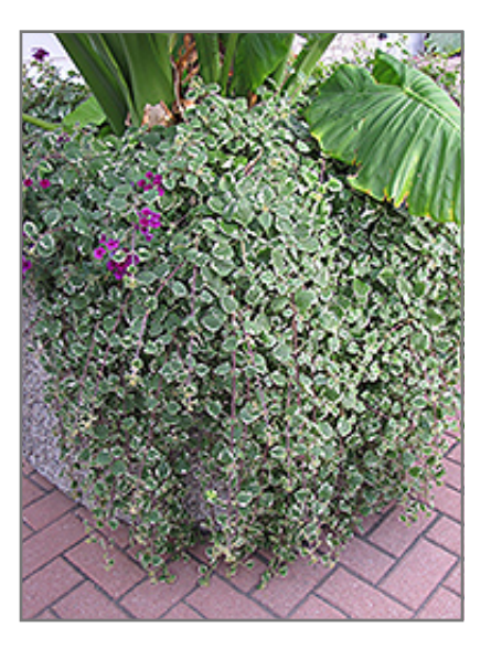
Swedish Ivy

This is an herbaceous evergreen houseplant with a trailing habit of growth, eventually spilling over the edges of hanging baskets and containers. Its relatively fine texture sets it apart from other indoor plants with less refined foliage. This plant can be pruned at any time to keep it looking its best.